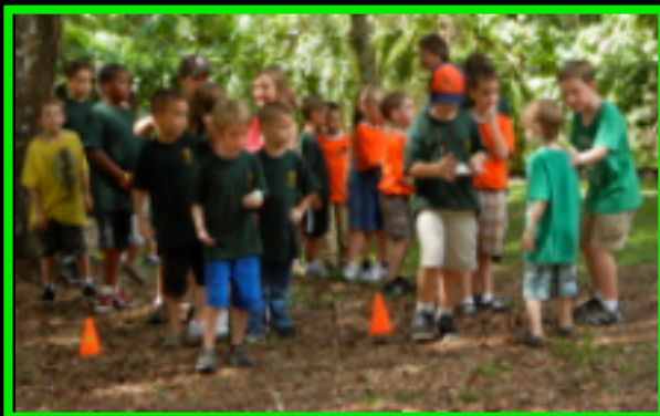
Family Picnic Ft. Christmas 9.24.2011