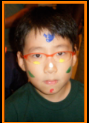
New Tigers 9.20.2011