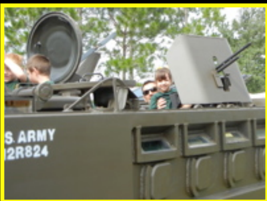
National Vietnam War Museum