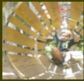
Wolves take on the tunnel at ZOOMAIR!