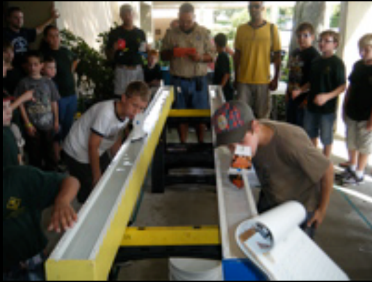
Raingutter Regatta September 25, 2010