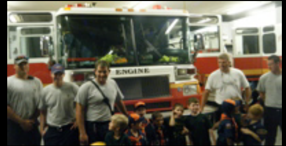
Tigers Go-See-It Fire Station #27 September 28, 2010